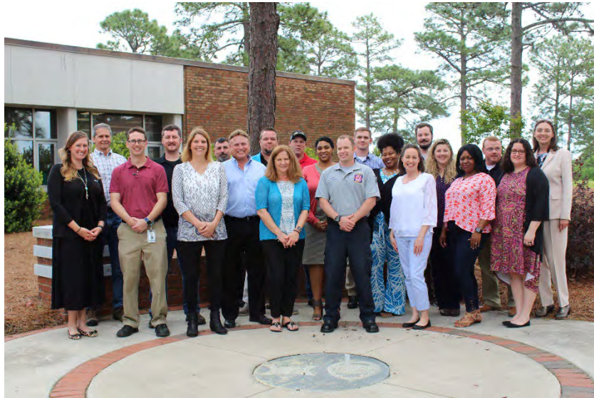
Dedman Leadership Class 2019

To ensure that the college has the necessary financial, human, technological, and physical resources, including having funds to advance the excellence of its programs; hiring faculty and staff of the highest quality who reflect its diverse community and exhibit its core values; providing appropriate technology; and ensuring that the campus is clean, safe, and beautiful.