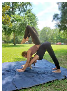
Creative Living Class: Yoga on the Lawn

Thank you for teaching at Sandhills Community College!