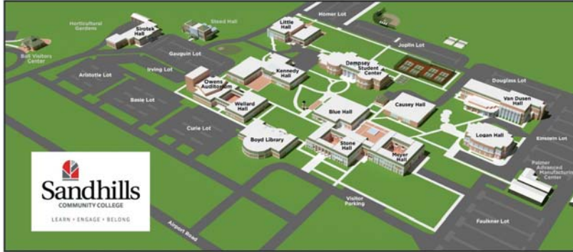
Campus Map Illustrated by Gaming & Simulation Development Student Gareth DeJardin