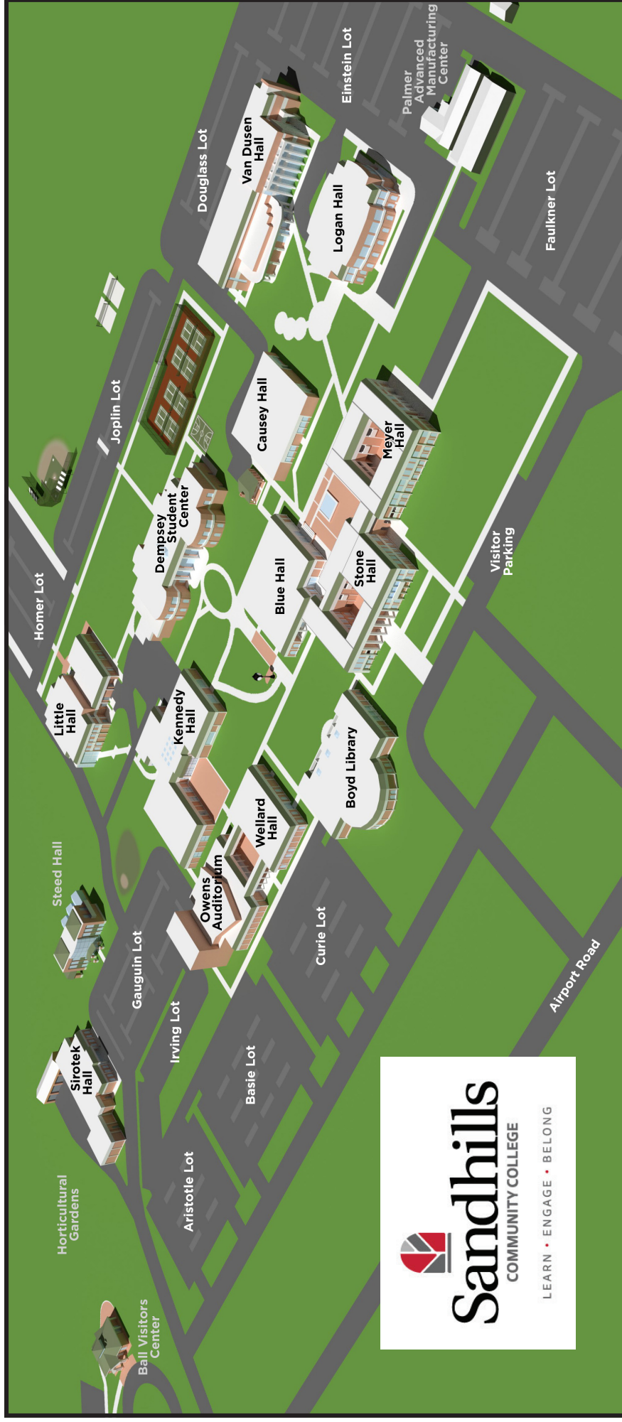
Campus Map Illustrated by Gaming & Simulation Development Student Gareth Desjardin